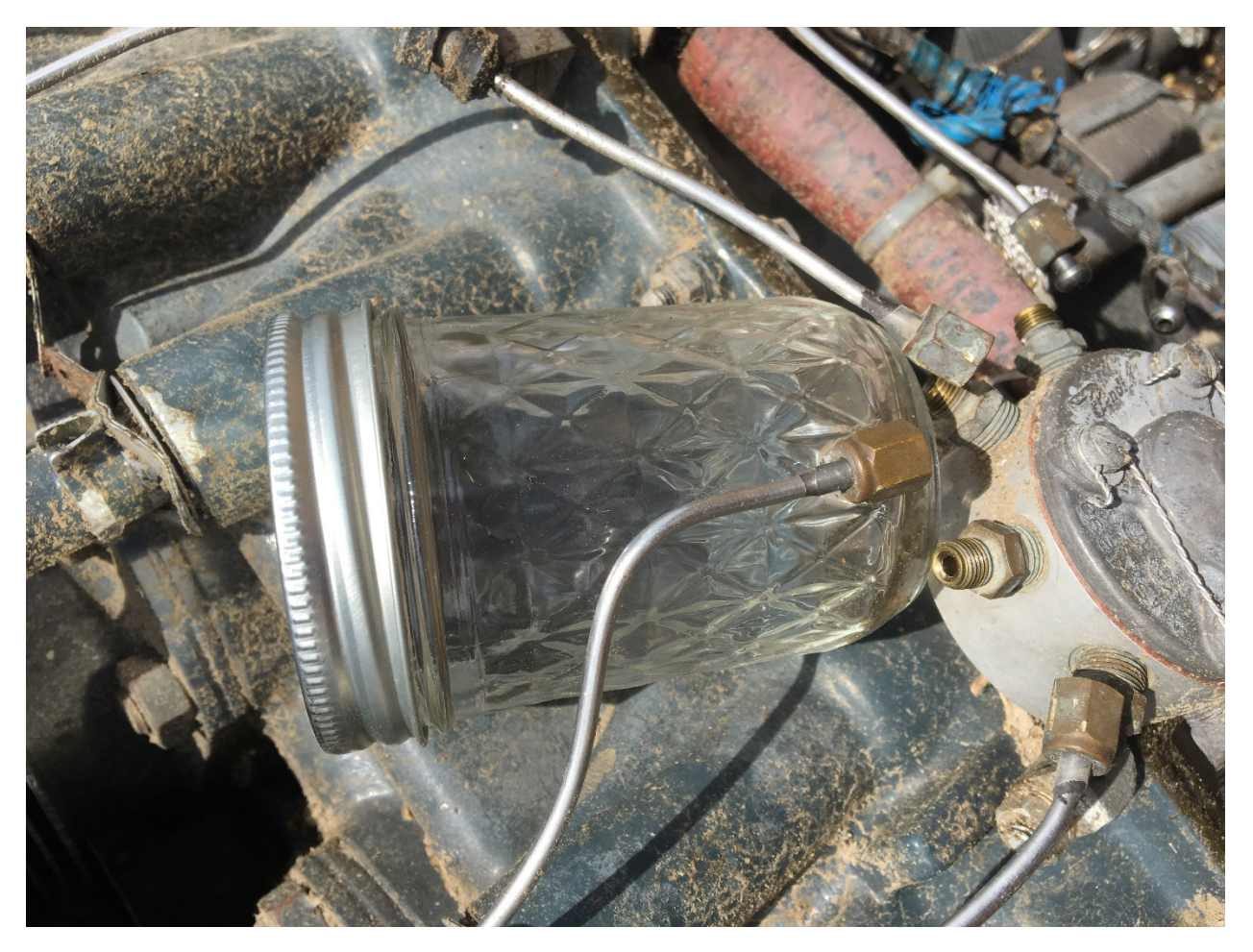
Photo 4: Fuel Sample from Fuel Line to Right Engine Fuel Manifold Valve