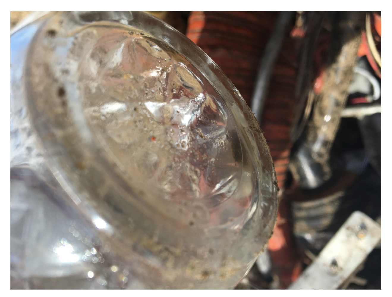
Photo 5: Fuel Sample from Fuel Line to Left Engine Fuel Manifold Valve